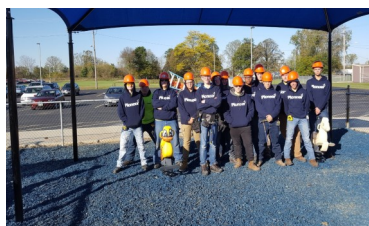
Left: Students in Home Remodeling work on playground.