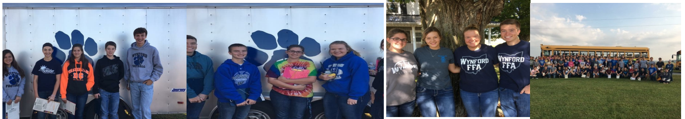
From left to right: Wynford District rural soils team, Wynford District urban soils team, Wynford State Urban Soils team, Wynford FFA chapter